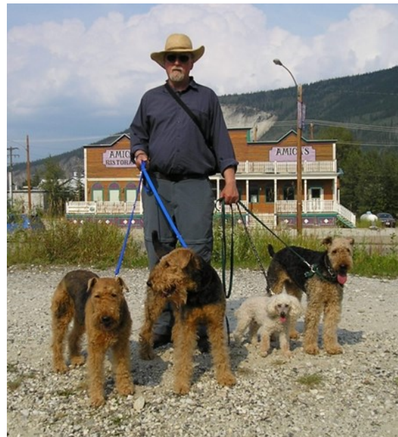
Dad with Airedales and their buddy, the Toy Poodle, in Dawson City some years ago

My husband and I have traveled with dogs for years. At one point, our method of travel involved a truck and small camper. We managed to stuff two Airedales and a Toy Poodle into this rig quite well. Later, a fifth wheel was purchased “for the dogs,” says my husband. Into the fifth wheel we bundled three female Airedales and, of course, the Toy Poodle.