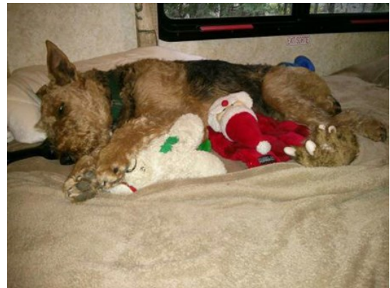
Snoozing on my bed with his toys!

Bringing along a bag of favorite toys proves to be an asset when one is traveling with Airedales!