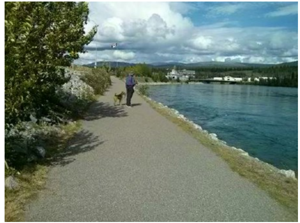
Daisy walking with Dad by the Yukon River

The dogs were exercised at least four times daily on leash. They adapted well to this routine but were delighted when we occasionally encountered a dog exercise area in a campsite where they could race about unleashed for a time or visited friends with fenced yards.