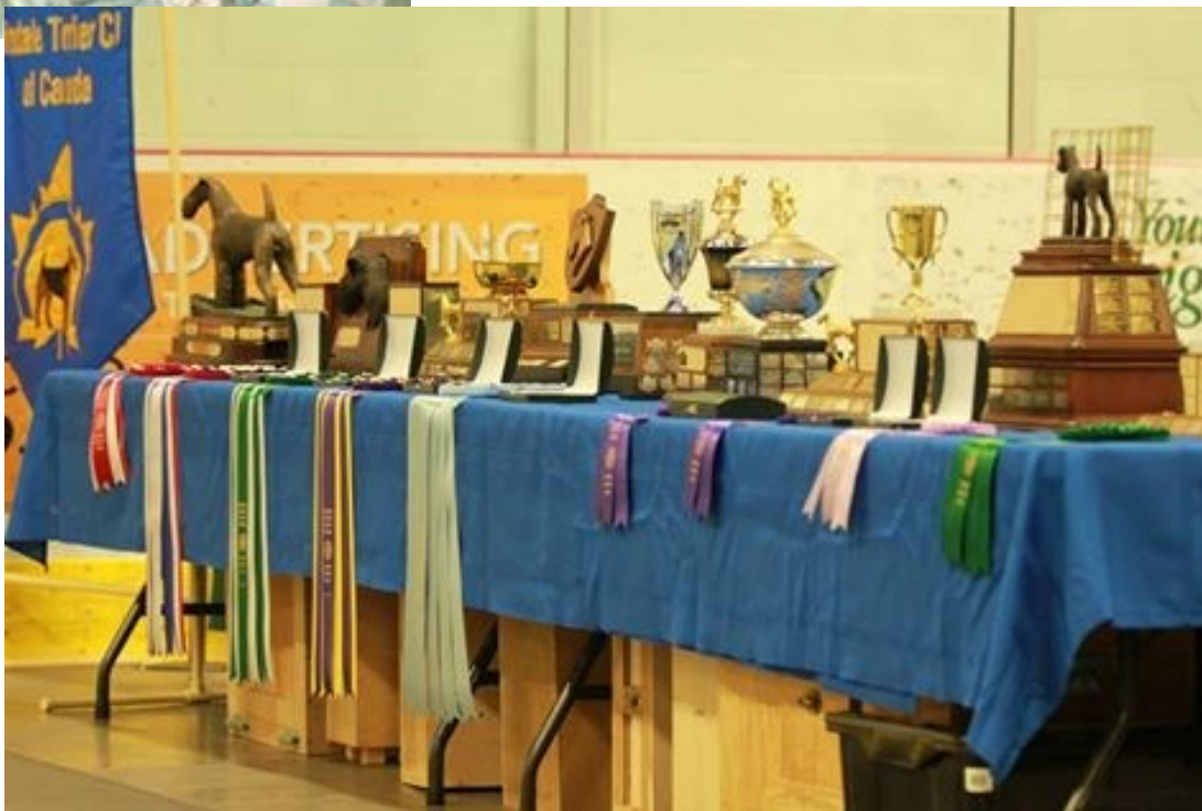
Specialty Trophy Table