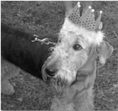
The beautifully bonneted guests begin to arrive