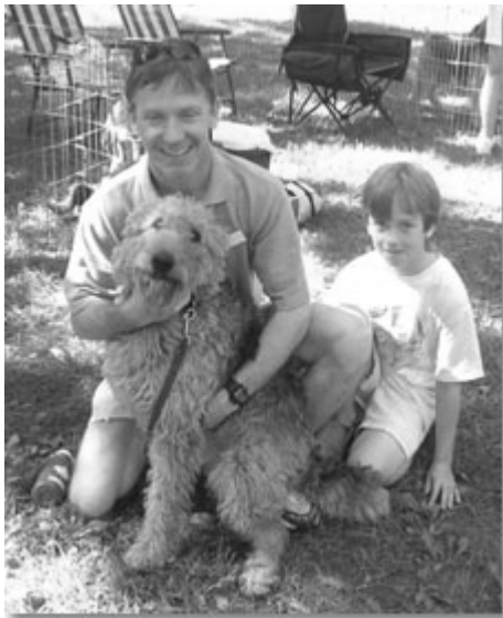
Fun for the whole family!