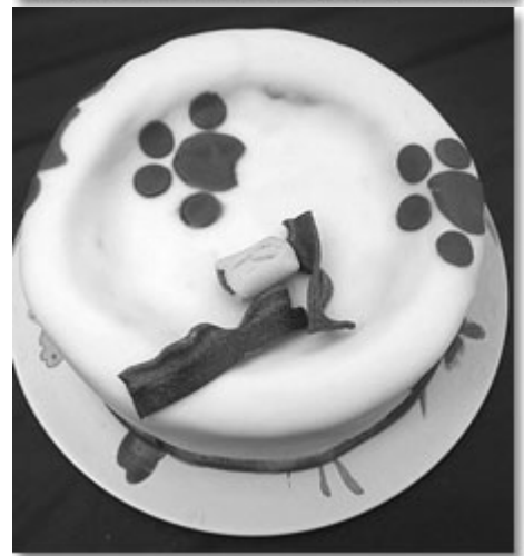
Airedale Anniversary Cake masterpieces!