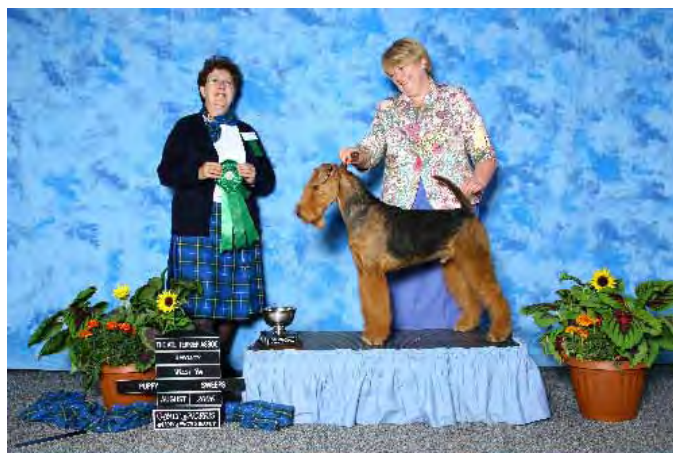
Regalridge Penaire Bronco Bill