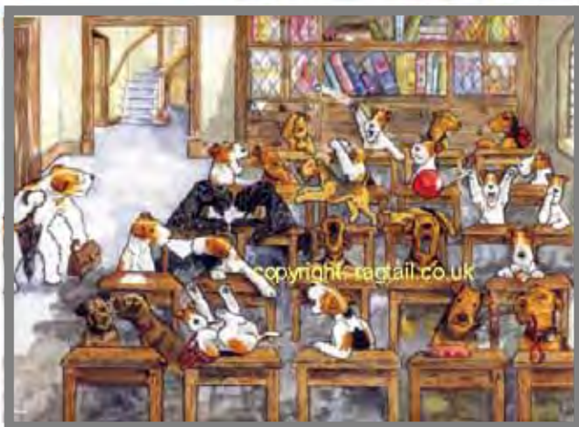
Rough Terrier School