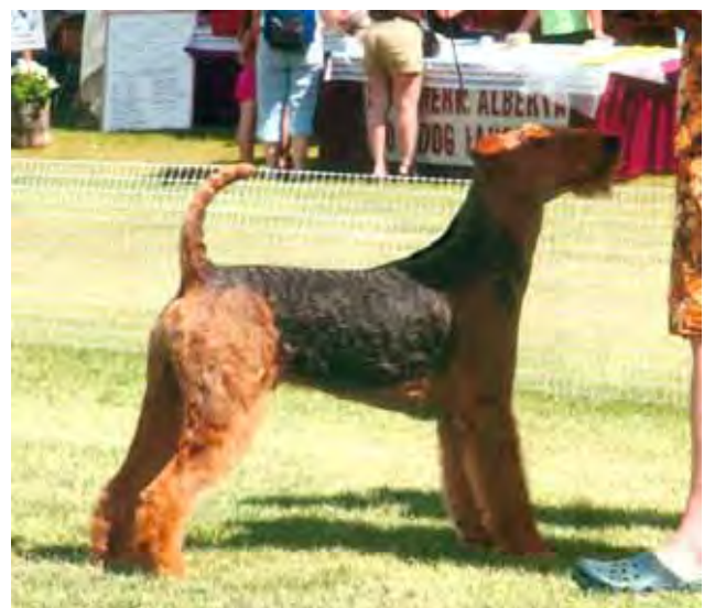
Brea's Blame It On The Moon