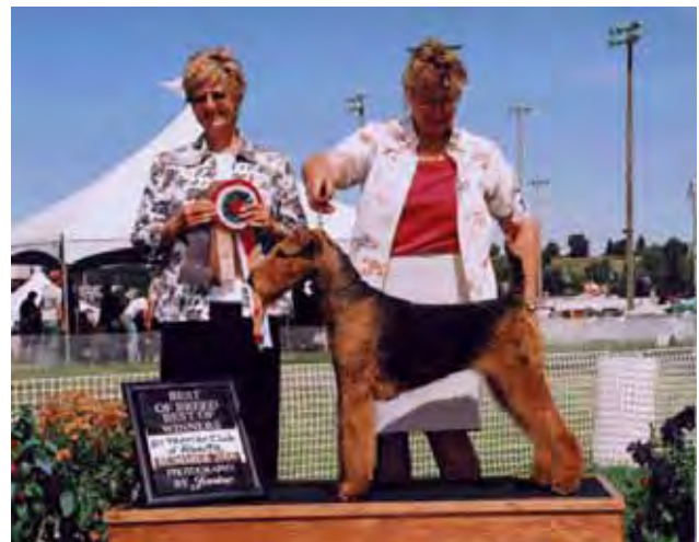
Am/Can Ch Monterra Misguided Angel