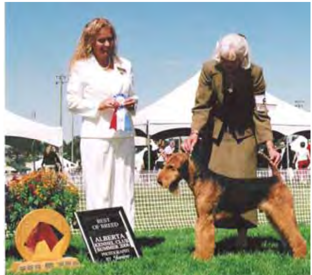
Am/Can Ch Indus Strike it Rich at Winsea