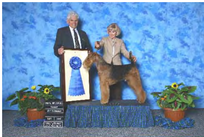
Am Can Ch Penaire's Commodore

We will all display our medallions proudly and want, once again, to thank the National Club for its' support.