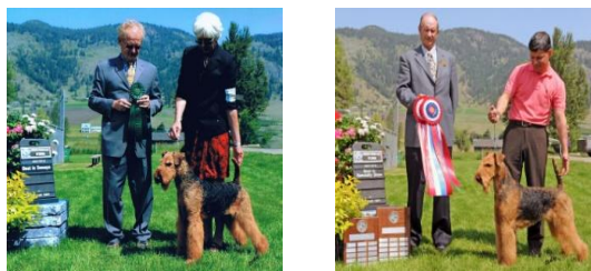
'Flame'..Ch. Winsea's Fyreworx