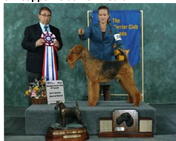
Ch. Copperfields Lion Heart