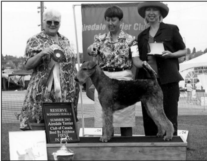
Reserve Winners Bitch COPPERHILL CASSIOPEIA