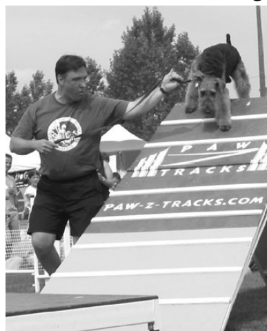
Ross & Pippin