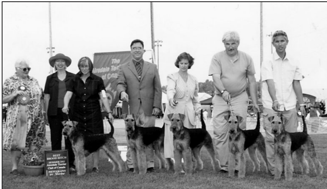
Best Dam & Progeny CH. NIGHTSUN BRIGHTEST STAR, CDX, NIGHTSUN SOLAR FLARE, CH. NIGHTSUN CHASING THE DREAM, CH. NIGHTSUN DAZZELING STAR, CH. NIGHTSUN CHIANTRA AURORA