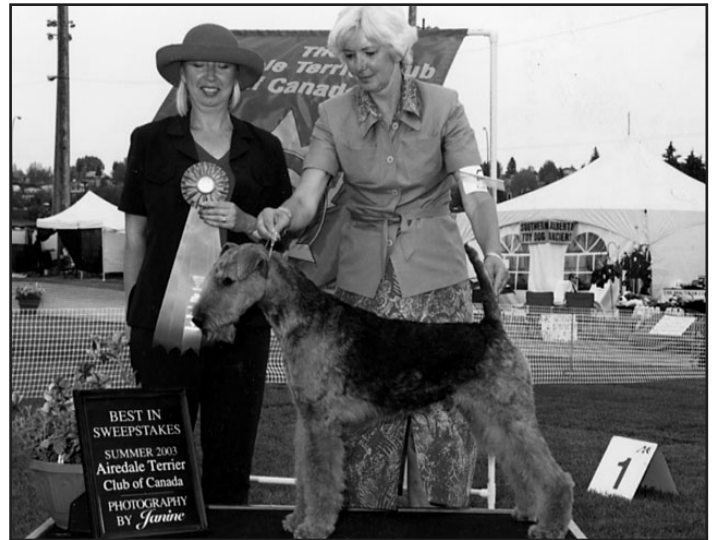
Best In Sweeps INDUS STRIKE IT RICH AT WINSEA