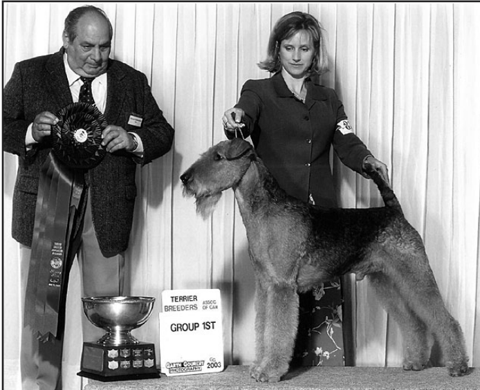
Best In Terrier Specialty BIS BISS Am/Can Ch Oakrun's Blue Jay Of Paradym