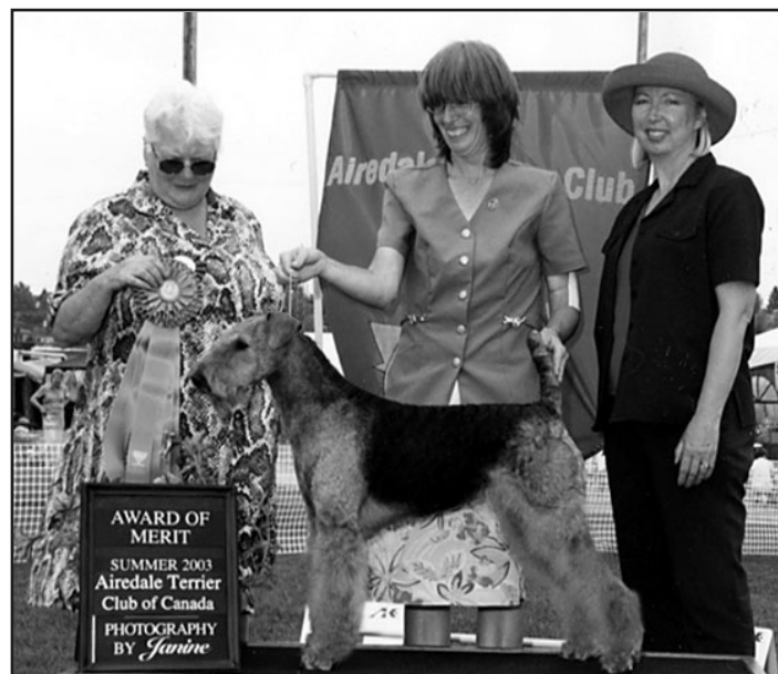
Award of Merit CH. BREA'S SECRET AFFAIR