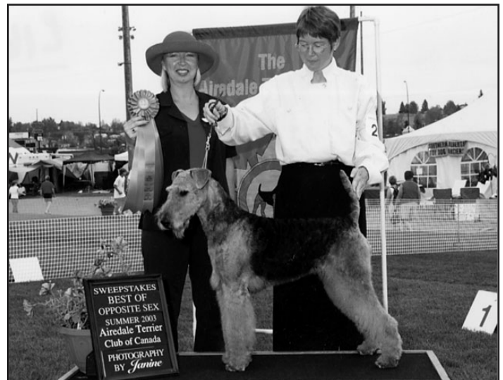
Best Opposite in Sweeps FYREBRICK'S RIVERDANCE