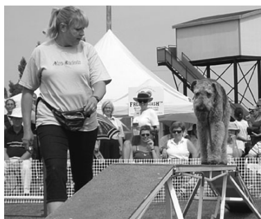
and from the Yukon