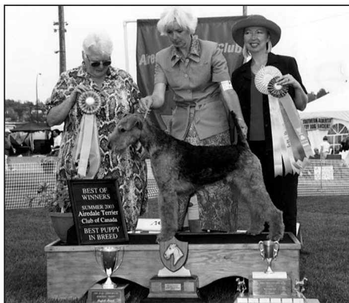
Best of Winners & Best Puppy INDUS STRIKE IT RICH AT WINSEA