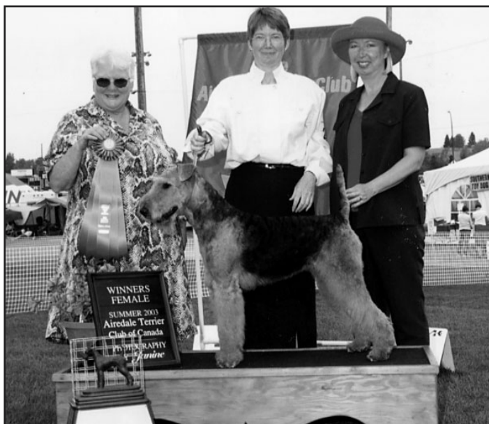
Winner's Bitch FYREBRICK'S RIVERDANCE