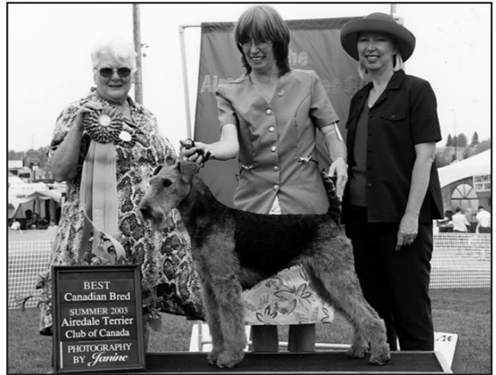
Best Canadian Bred COOLEAMBER JOYFUL NOISE