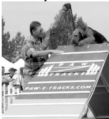
They came from Nebraska

Friends from all over came to try this out