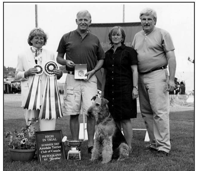
High in Trial NIGHTSUN MOONSHADOW CD