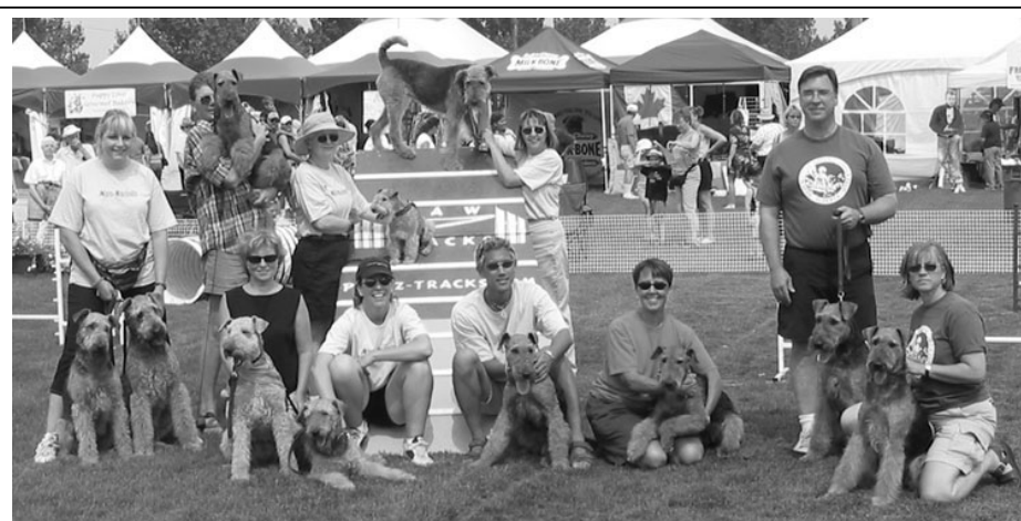
The 2003 Agility Gang