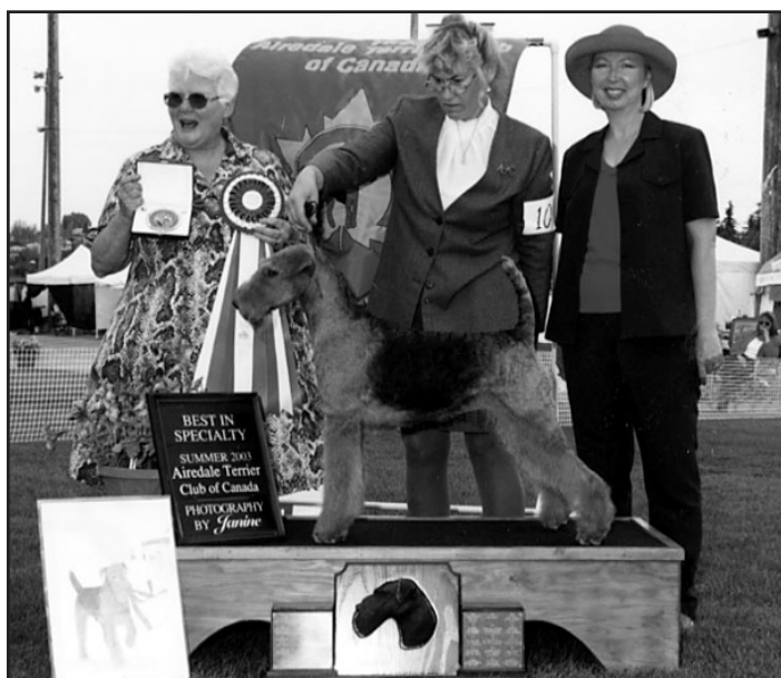
Best of Breed CH. MONTERRA SO MANY STARS