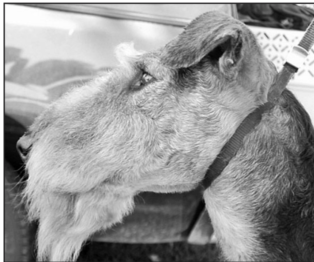
Reserve Winner's Dog IngleValley Soul Simplicity