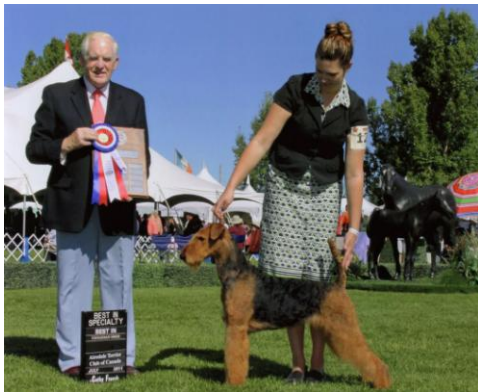
Ch. Winsea's Big Star

Best Canadian Bred: Ch Winsea's Big Star