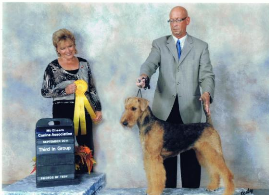
Ch. Joval's Charli Angel at Tappenaire