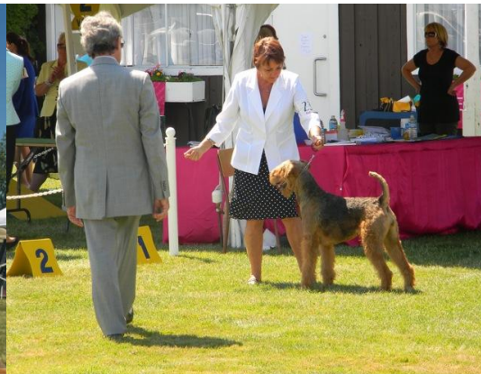
Ch. Indus Sydney by the Sea