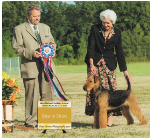
Ch. Winsea's Big Star