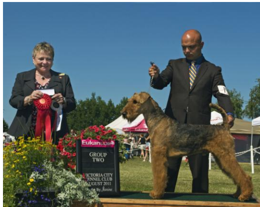
Ch. Indus Curteis Point