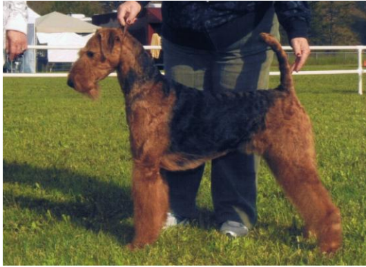
Ch. Joval's Charli Angel at Tappenaire