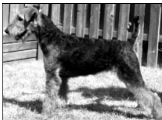
Best Puppy ASHCLIFF WILD ANGEL