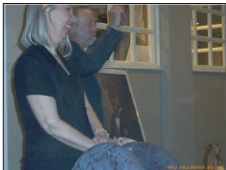
Action at the auction