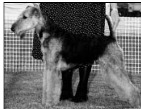
CAN. CH. WINSEA'S REBEL ANGEL (F) 'Reba'