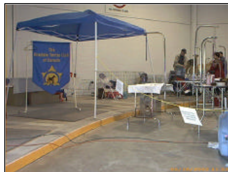
ATCC Grooming and Hospitality area