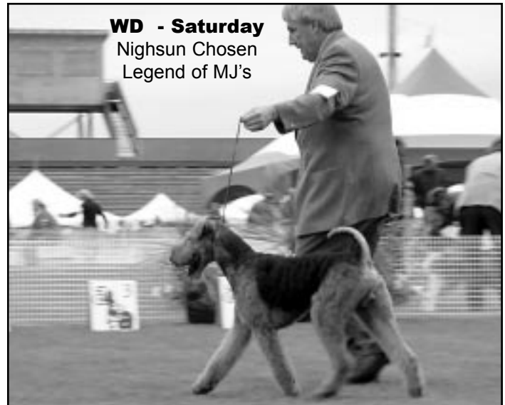
WD - Saturday Nighsun Chosen Legend of MJ's