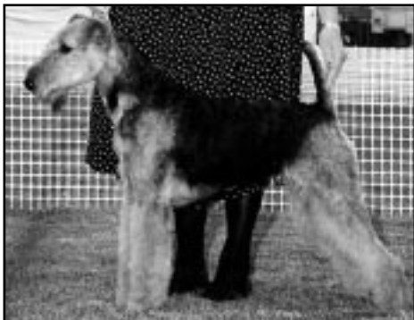
CAN. CH. WINSEA'S STRIKE ANY-WHERE (M) 'Striker'