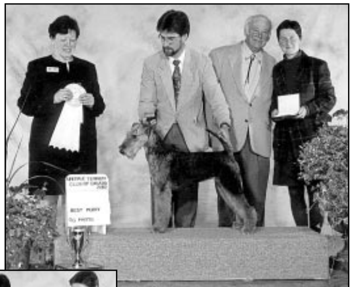
Best Puppy KLAUS'S AIRE KOLA, BREEDERS/OWNERS: KLAUS & NANCY TREPEZKT