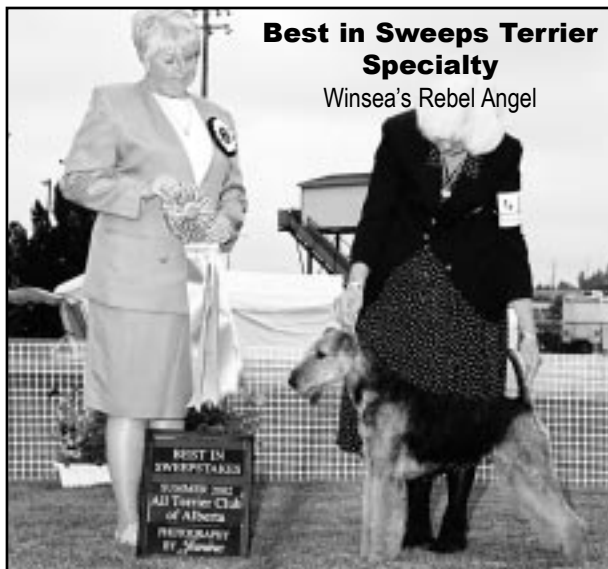
Best in Sweeps Terrier Specialty Winsea's Rebel Angel