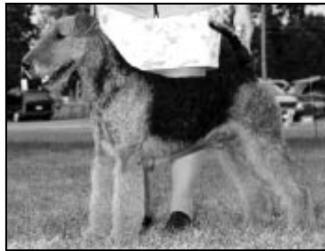
CAN. CH. INGLE VALLEY ROYAL HATRICK (M) 'Jaycee'