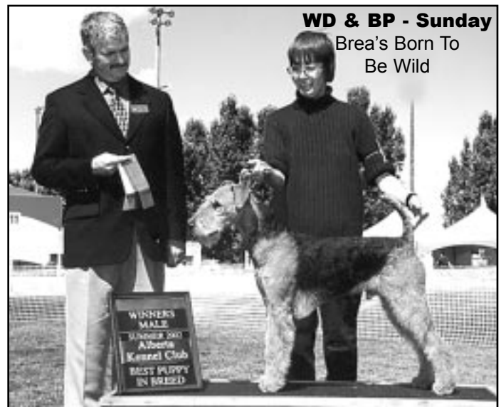
WD & BP - Sunday Brea's Born To Be Wild