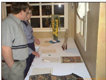
Silent auction viewing