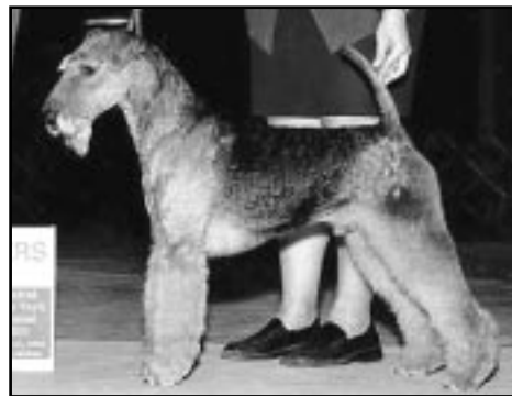
AM. CAN. CH. INGLE VALLEY INGLE ROYAL CROWN JEWELS (M) 'Hunter'