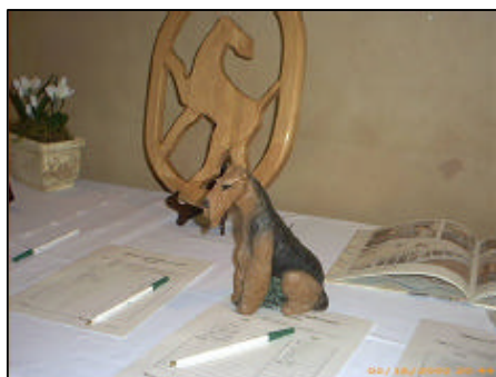
Great memorabilia for auction