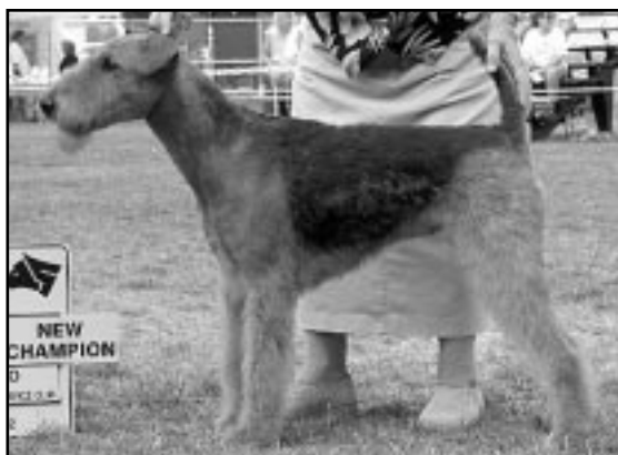
Winner's Bitch GARDENAIRE BLUE RIDGE