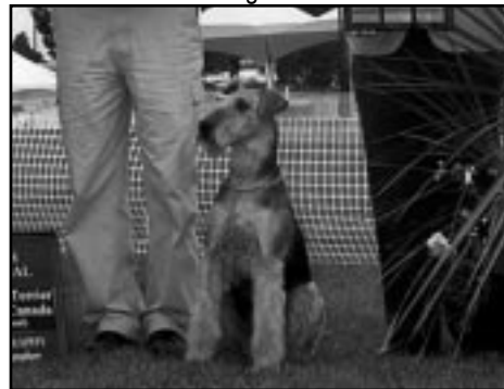
NIGHTSUN MOONSHADOW CD (F) "Zoe"