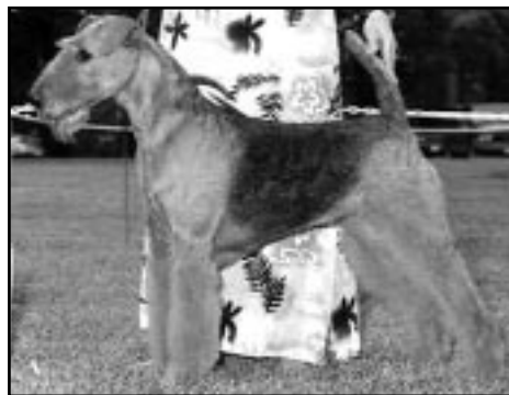
CAN. CH. PARADYM DIAMONDS DIAMONDS (F) 'Amber'