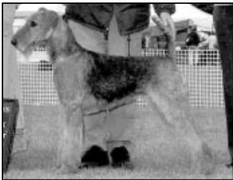
CAN. CH. BULAIRO SHBOOM (F) 'Shboom'