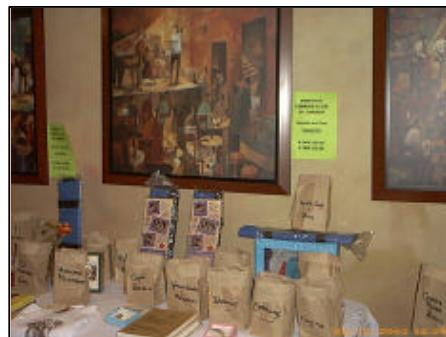
Chinese auction items