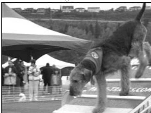
CH. MJ Robaire Night Sun Dancer CDX, JHDF The old guy doing agility. At 10 years old Dancer is always ready for some fun and games.