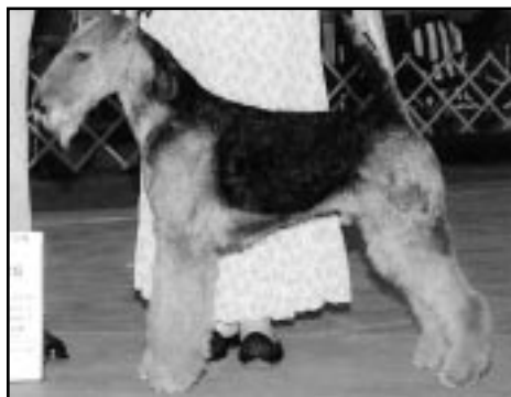
AM. CAN. CH. INGLE VALLEY MASK OF ZORRO (M) 'Watson'