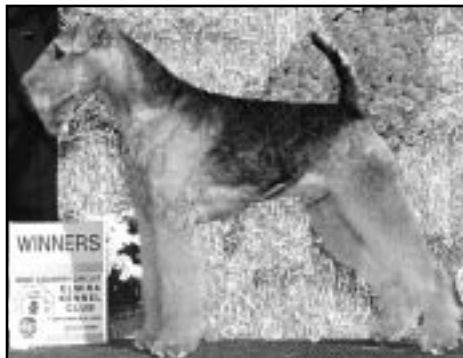
AM. CAN. CH. VALDONAIRE KING'S RANSOM (M) 'Jacob'