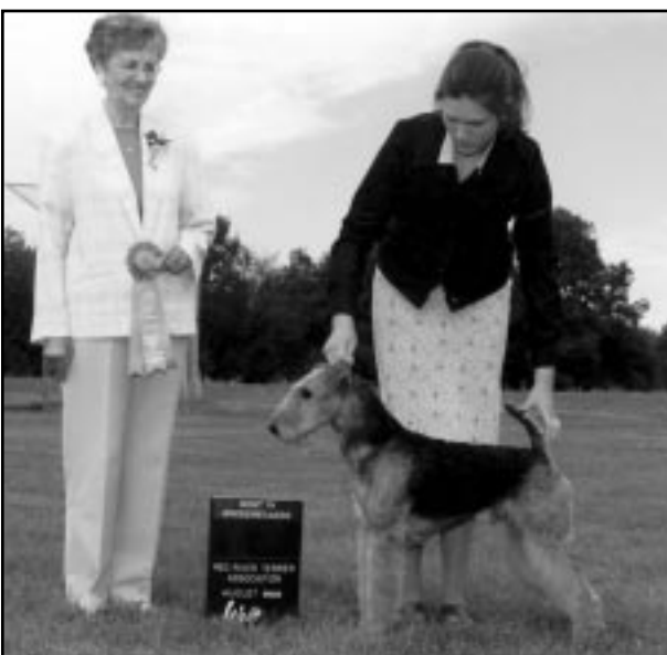
Best in Sweepstakes – Ch. Winsea's Strike Anywhere