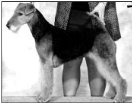
CAN. CH. INGLE VALLEY LUMINOUS MOTION (F) 'Shalyn'