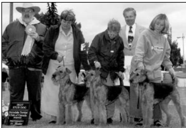
Sire & Get - Am Can Int Ch. Terydale HK King of Indus Bulairo Shboom & Indus Moonstruck