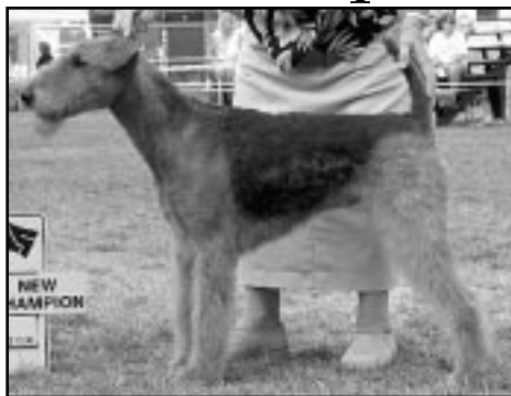
CAN. CH. GARDENAIRE BLUE RIDGE (F) 'Blue'