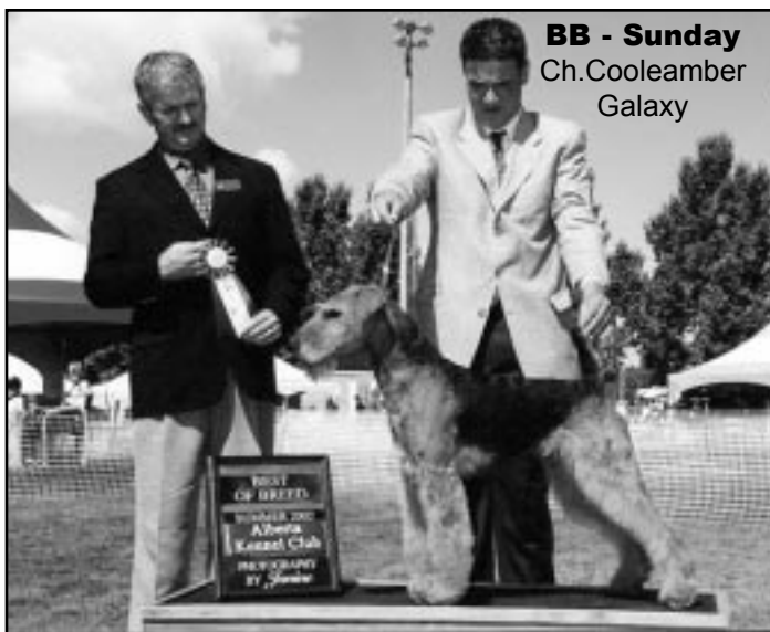
BB - Sunday Ch.Cooleamber Galaxy

SUNDAY - AUG 5 BB - Ch. Cooleamber Galaxy BOS - Ch. Northcote Madam Justice WD & BP - Brea's Born To Be Wild WB & BW - Cooleamber Joyful Noise