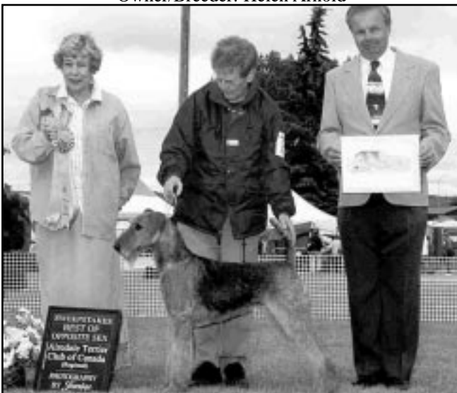
Best Opposite in Sweeps & RWB - Bulairo Shboom Owner/Breeder: Lydia Langley