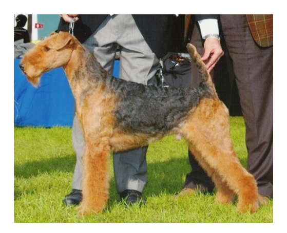
Best of Breed - Ch. Indus Strike It Rich At Winsea