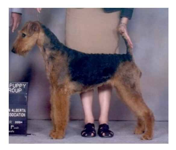
Best Puppy - Winsea's Escapade

Best of W inners/WB - New Ch Copperhill Cassiopeia