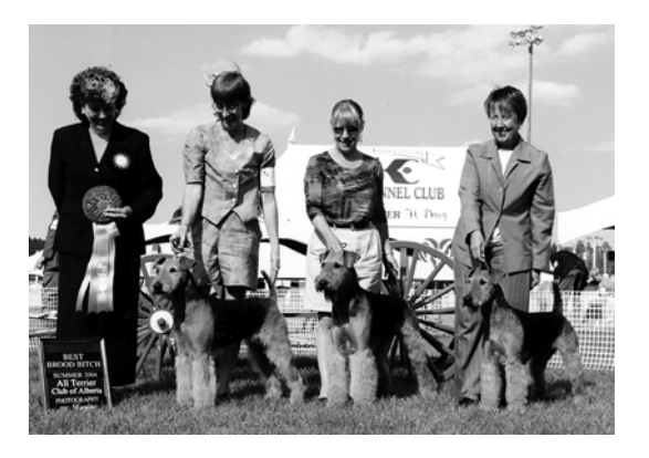
DAM & PROGENY - Ch Walnut Ridge Brea Wildaffair