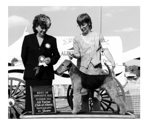
Best Opposite Sex - Ch Brea's Moon Maiden