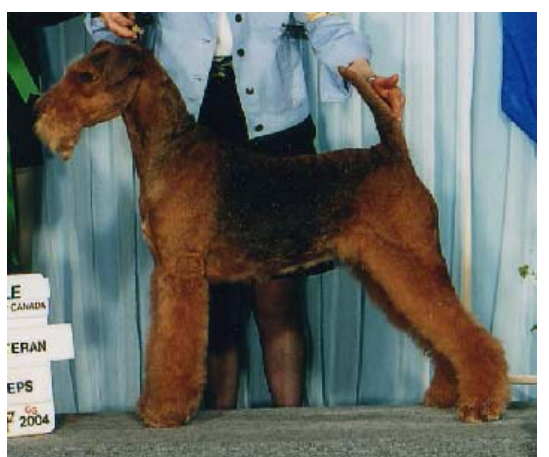
Best Veteran In Sweeps - Am Can Ch Penaire Dallas Star (as above)