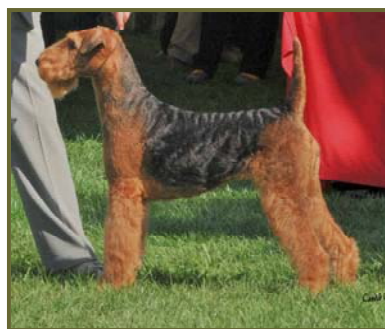
Ch Hollytroy's Elite