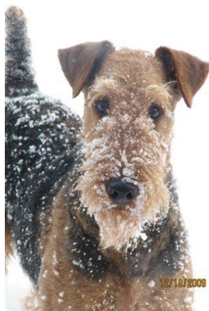
Princedale's Red Rose Rosalie