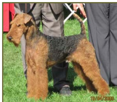
Reserve Winners Dog – Princedale's Highlight Harley