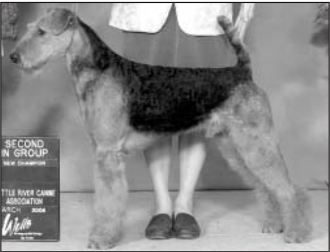
CH BREA'S ZERO GRAVITY - BOGEY Am Can Ch Cooleamber Galaxy ex Ch Walnut Ridge Brea Wildaffair Owner: Bev Jackson, Breeder: Pam Sheane