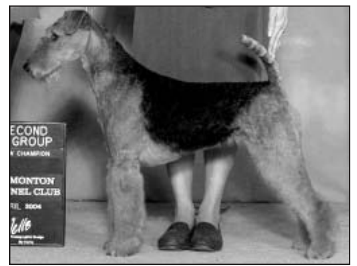
CH BREA'S MOON MAIDEN - ERYN Am Can Ch Cooleamber Galaxy ex Ch Walnut Ridge Brea Wildaffair Breeder/Owner: Pam Sheane