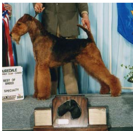
Best In Specialty - Am Can Ch Penaire Prince Of Egypt ( Reydale Prince Of Thieves x Ch. Penaire Dallas Star)