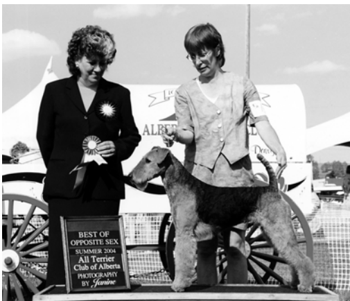
Best Opposite Sex - Ch Brea's Moon Maiden