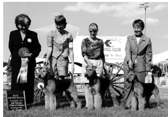
DAM & PROGENY - Ch Walnut Ridge Brea Wildaffair