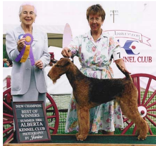
Best of W inners/WB – New Ch Copperhill Cassiopeia