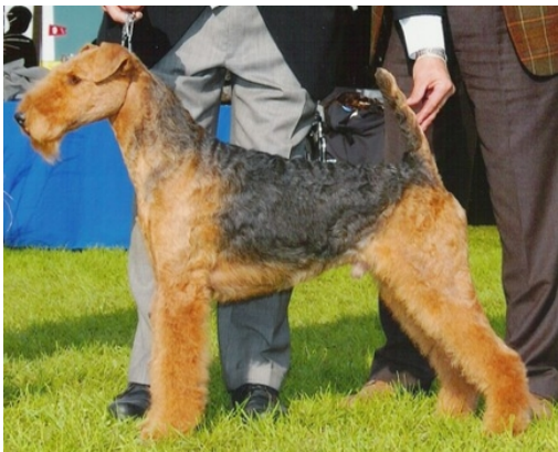
Best of Breed - Ch. Indus Strike It Rich At Winsea