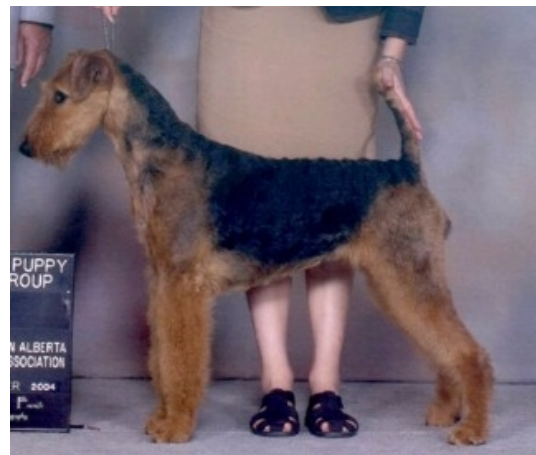
Best Puppy – Winsea's Escapade